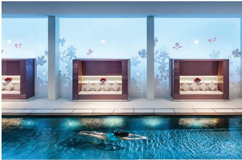
DIVE RIGHT IN From top: The spa at the Mandarin Oriental; Sébastien Gaudard's stellar patisserie.