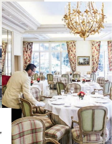
VIEW LA LA! Clockwise from left: The skyline, from the Oiseau Blanc, at the Peninsula; the Epicure at the Bristol; the winter garden at the Hôtel Maison Souquet.